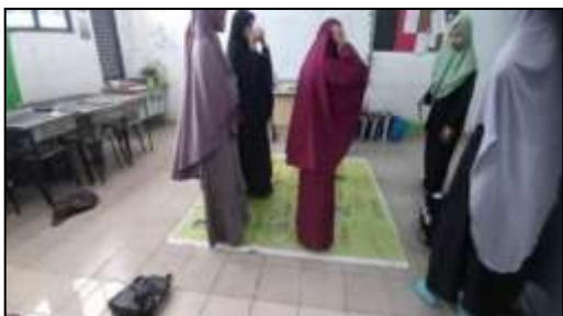
Picture 2. snake and ladders game

According to statistical data analysis, there is no difference in average stress levels between the pre-test and post-test, and the educational media Snakes and Ladders cannot reduce students' stress levels. Then, based on the aforementioned data, it was determined that six students received authoritarian parenting and four individuals received democratic parenting. It can be concluded that there is no difference in student tension based on parental style, it can be concluded. This educational application of snakes and ladders can only be effective if students can answer math queries on cards that have been matched during the game's stages.